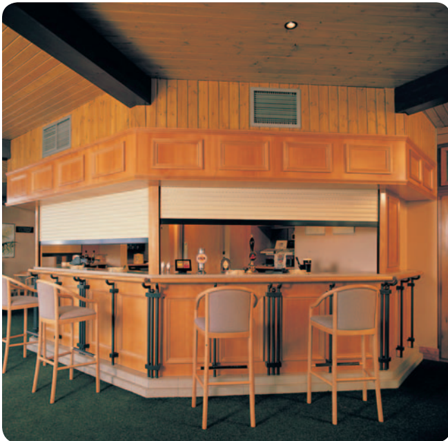
RA2, heat and sound insulation, light easy operation. Shown vented

There are products suited to differing environments and security levels, all however, are designed to be very compact. Tight coiling of the shutters means housings are small and do not require large headroom for the shutter box, with wide spans possible within the range, wider if intermediate fixed or removable guide rails are employed.