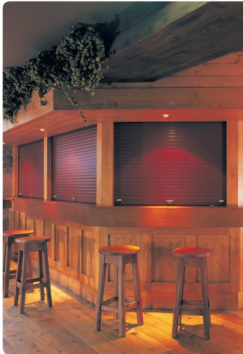
RA4, tough, secure, yet sympathetic to interior design.