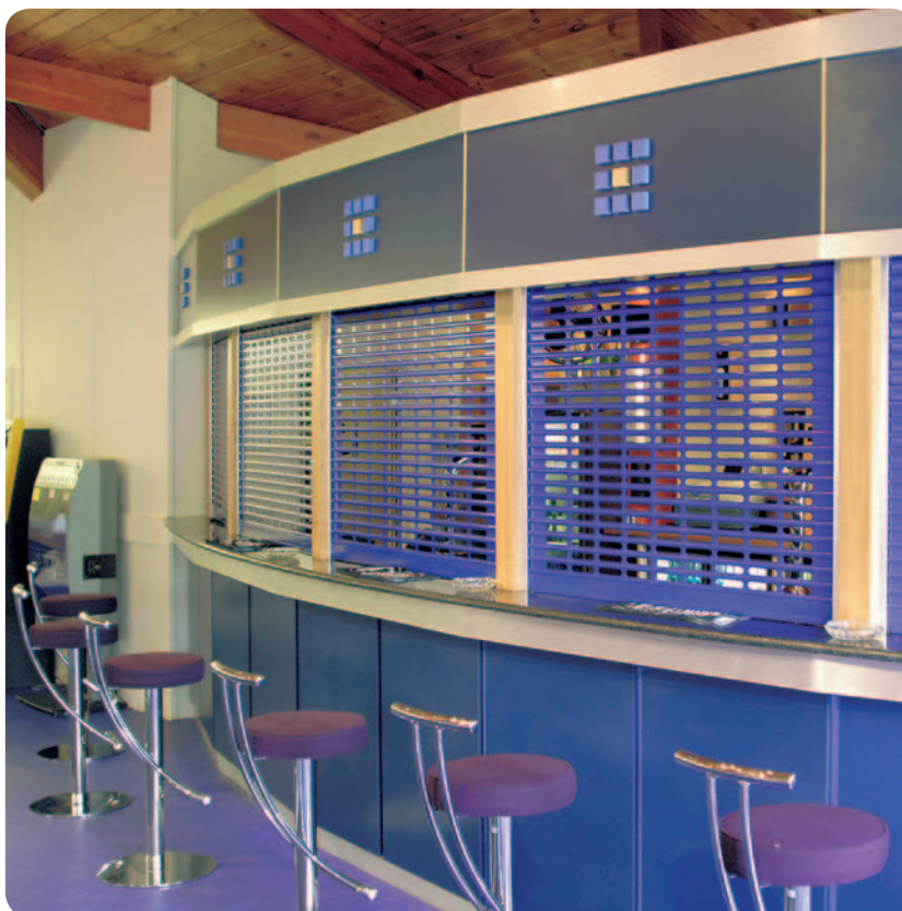
RA4 Vision, very light in use with good strength and vision.